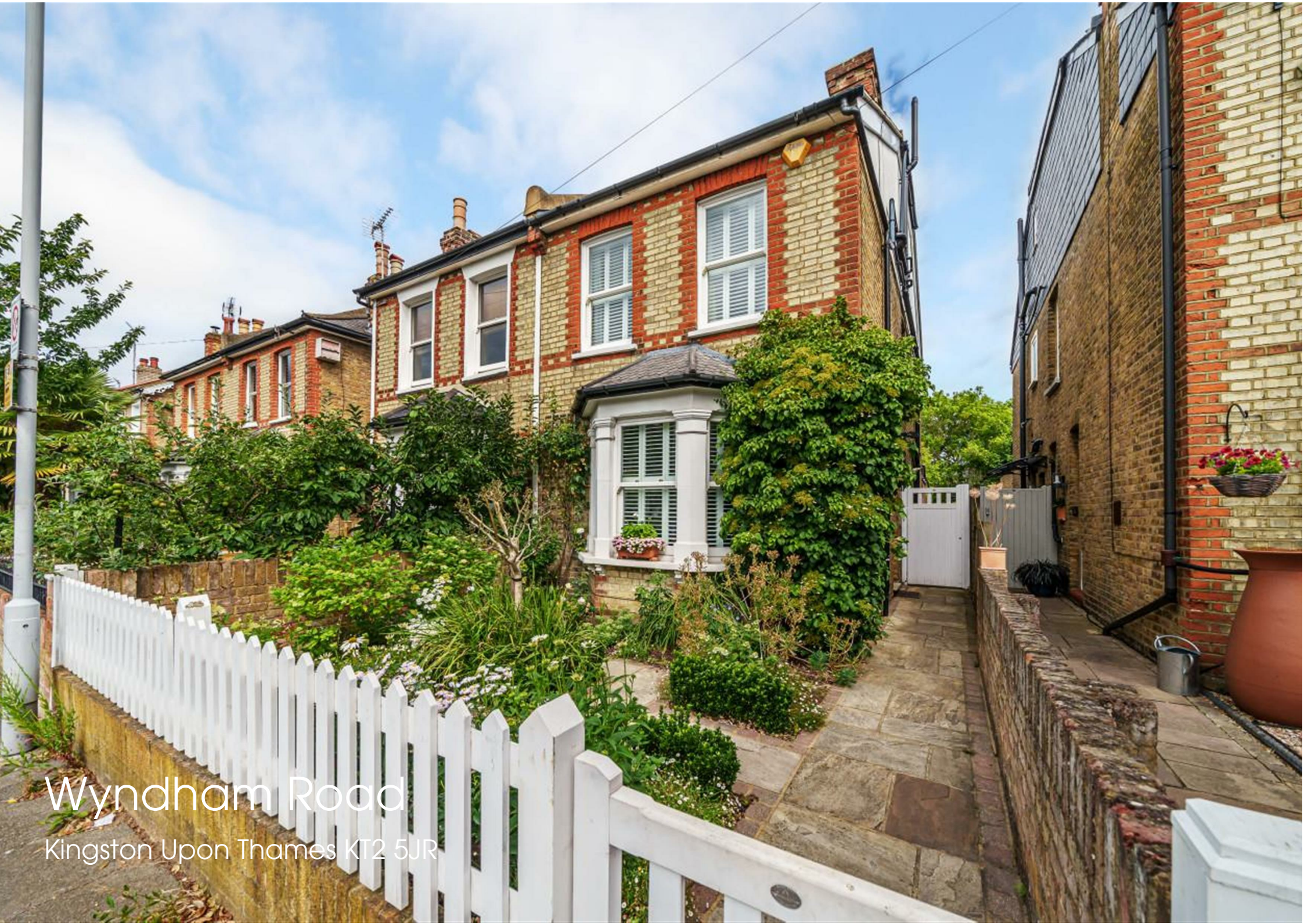
Wyndham Road Kingston Upon Thames KT2 5UR

34 Richmond Road Kingston upon Thames Surrey KT2 5ED www.gibsonlane.co.uk Tel: 020 8546 5444